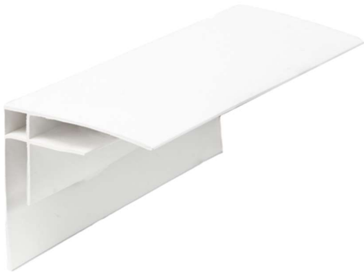
Figure 1. Corner Trim- Inside (2½’’x 2½’’)

Depending on project requirements, the RELINE® Corner Trim - Inside is designed to be installed as an inside corner but can also be installed on the outside of an existing wall. The Corner Trim needs to be installed ahead of the RELINE® panels.