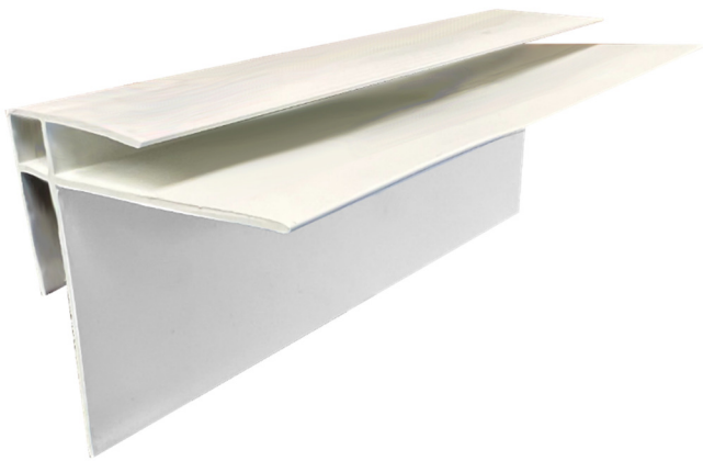
Figure 1 90° Corner Trim (2½" x 2½")

Depending on project requirements, the RELINE® 90° Corner Trim can be installed on the inside or outside of an existing wall. The Corner Trim needs to be installed ahead of the RELINE® panels.