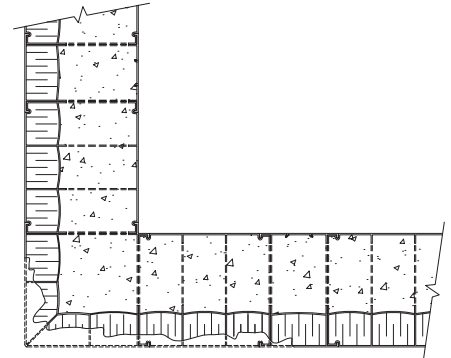
Figure 1 - Damaged Wall