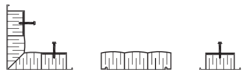
Figure 3 - Replacing Facing Components