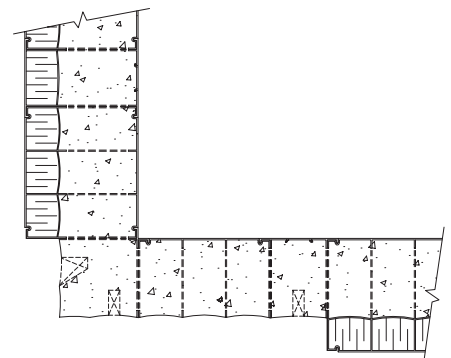
Figure 4 - Drilled Holes