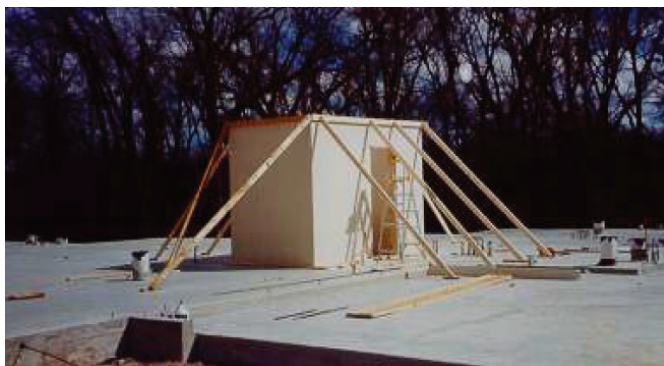
In House Shelter

Nuform Building Technologies brings decades of experience in stay-in-place concrete forming systems to the growing demand for safe rooms in residential and community settings. Our Safe Rooms are built using the patented CONFORM ® forming system , which creates monolithic reinforced concrete walls while remaining in place as a durable, maintenance-free finish.