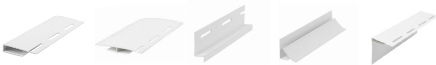
J Trim (2 1/4" x 3/8") H Trim (4" x 3/8") Drip Trim (1 5/8" x 3/4") Cove Trim (1 1/4" x 1 1/8") F Trim (3" x 2 1/4")