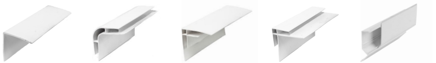
Corner Angle Trim (2" x 2") Rounded Corner (2 1/2" x 2 1/2") Inside Corner (2 1/2" x 2 1/2") Outside Corner (2 1/2" x 2 1/2") Crown and Base Molding (3 1/2" x 1")