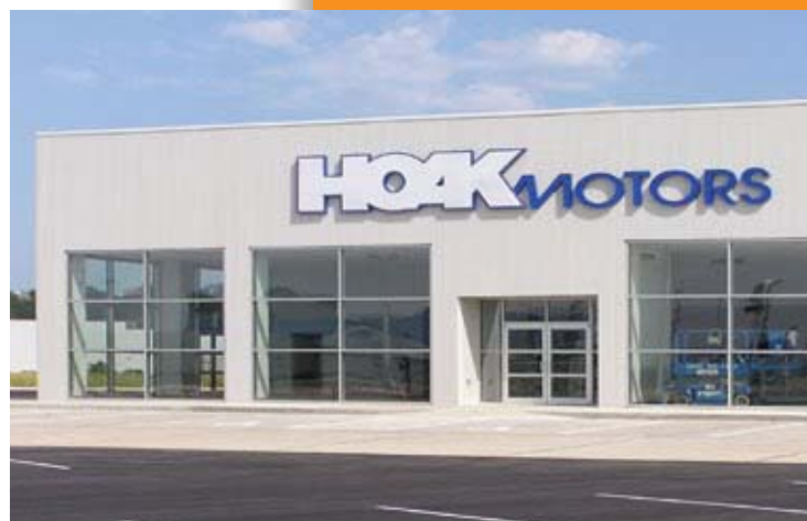
Commercial / Industrial