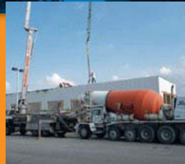
3. Concrete Pour