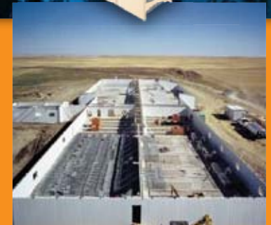
4. Completed Walls

Rigid polymer forms easily slide together, creating durable pre-finished walls that can be constructed quickly in any climate.