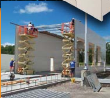
1. Wall Erection