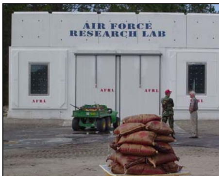
1000 lbs. of Explosives at 75' from walls

The charge for the blast test consisted of 1,000 lbs. of ammonium nitrate and fuel oil (ANFO) and was detonated 75' from the test walls. (4,800 lbs of the same material was used in the Oklahoma City bombing at a distance of 20') The CF8 was expected to sustain significant damage and the CF8i was expected to fail altogether. This would allow the AFRL engineers an opportunity to assess how the walls failed and also determine the polymer's ability to contain and shield personnel from the concrete fragments entering the interior of the building.