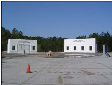
AFRL Test Site, Tyndall AFB, Florida

On March 19, 2004, the Air Force Research Lab (AFRL) at Tyndall Air Force Base in Panama City, Florida performed a blast test on two concrete walls constructed with Conform. Specifically the CF8 (8" concrete) and the CF8i (6" concrete + 2" insulation) were used at the test site. The test was conducted to study the blast resistance and fragmentation of walls using Conform. The walls were unreinforced and were poured with a 4000 psi concrete mix.