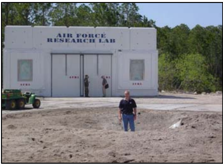
The Blast Created a 3'-4" Deep Crater

Conform has been used by the US Military for a wide variety of applications around the world, including the expedient construction of barracks, clinics, latrines, community centers, schools and utility buildings.