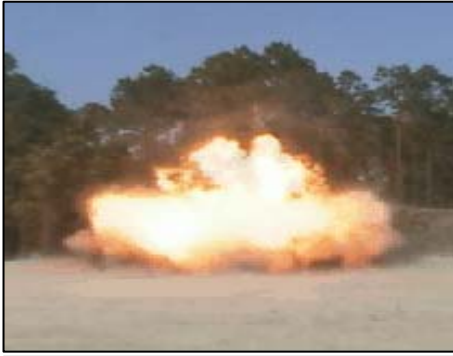
Detonation of 1,000 lbs. of ANFO

Conform has been used by the US Military for a wide variety of applications around the world, including the expedient construction of barracks, clinics, latrines, community centers, schools and utility buildings.