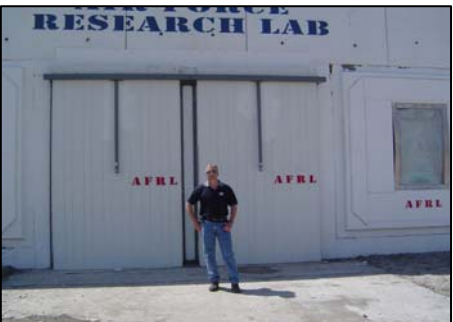
CF Walls After the Blast – No Damage

Now, with an understanding of Conform inherent blast resistance, the scope of applications can logically and assuredly expand to include blast protection for existing facilities, ammunition bunkers, office facilities, storage buildings and any other federal and military construction that requires enhanced hardening and associated force protection capabilities. The system can also provide a solution to stand-off requirements on real-estate constrained installations. These benefits, coupled with the cost effectiveness of a rapid construction system, make Conform a winning combination for today's security conscious environment.