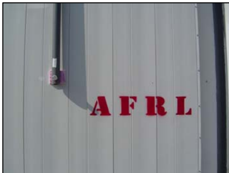
CF8 & CF8i Walls Filled with Concrete

Over the past several years, AFRL has been evaluating and testing various types of polymers and wall configurations to study their blast mitigation properties. Nuform became aware of their research and was especially impressed with test results the lab had achieved with extruded polymer sheeting. Nuform hypothesized that a concrete wall completely encased in a polymer form would have to provide similar if not improved results.